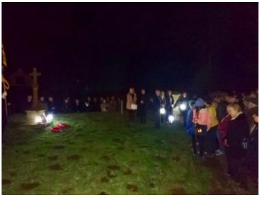
The commemoration service at the war memorial

display, watching the beacon, and listening to the bells. The parish council wants to thank everyone who contributed in any way to the amazing success of the event, and to all those who attended to pay our respects to those the parish lost a hundred years ago.