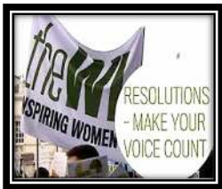
WI Resolutions 9 th May 2018