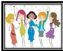
Social 13 th June 2018