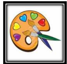
Anyone can learn to Paint 11 th July 2018

VISITORS & NEW MEMBERS ALWAYS MADE WELCOME