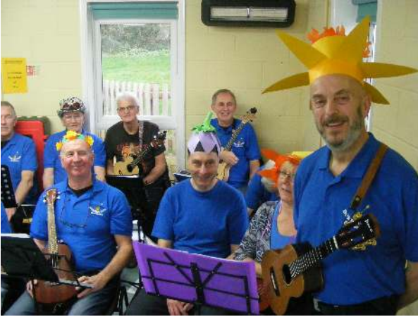
DukesUkes in their Easter bonnets, March 2017

Thank you for supporting the craft fairs held in November last year and March this year at the Hall, especially to all the helpers and the donators of tombola prizes! Both were very successful events, packed with craft stalls selling seasonal items made and sold by the crafters themselves. Entertainment was provided on both occasions by the Daventry ukulele band, DukesUkes , who have quite a fan base in this area now!