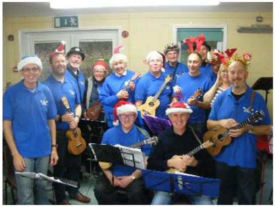
DukesUkes at Pattishall Christmas Craft Fair, Nov 2016

With Mother's Day only a week away, Sunday 19 March is the perfect day to come and shop for that perfect gift at the Pattishall Spring Craft and Gift Fair. There will be lovely Easter gifts too as that is only just around the corner. There will be 30 stalls selling a wide range of British hand crafts, all unique and made by skilled crafters. You won't find these items on the high street. So do come and have a browse and a chat with the talented crafters. There will be many lovely things to buy as a gift for Mother's Day or Easter, or you could always treat yourself.