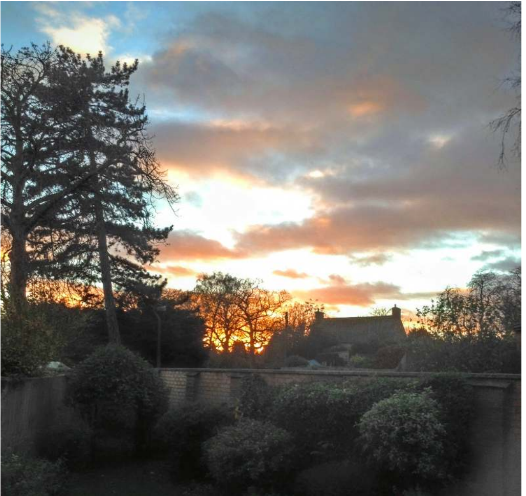
sunrise over The Beeches, Pattishall, November 2015