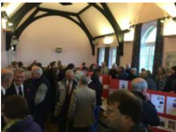
Relatives and parishioners at the exhibition