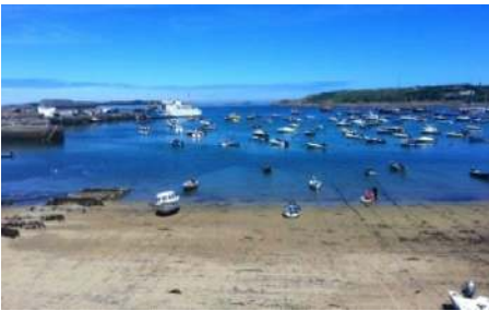
View from the flats

Lovely harbourside flats in the Isles of Scilly available for rent from April – October.