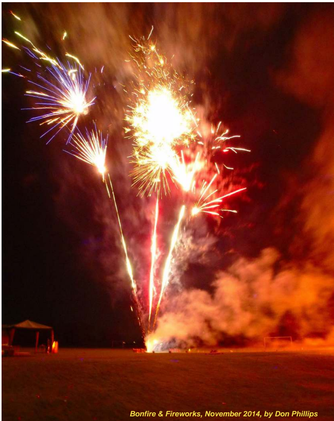
Bonfire & Fireworks, November 2014