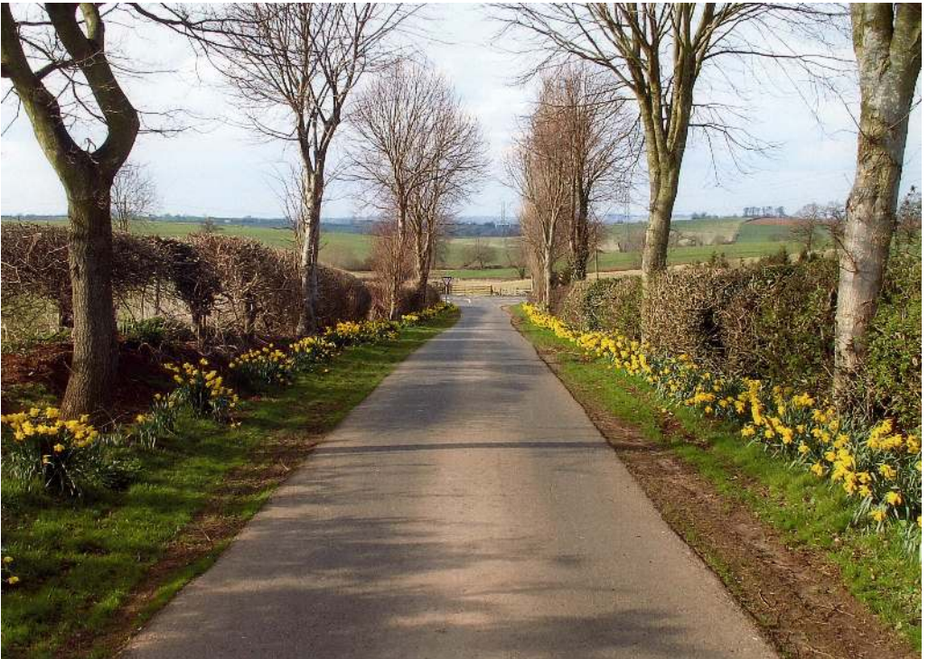
Pound Lane