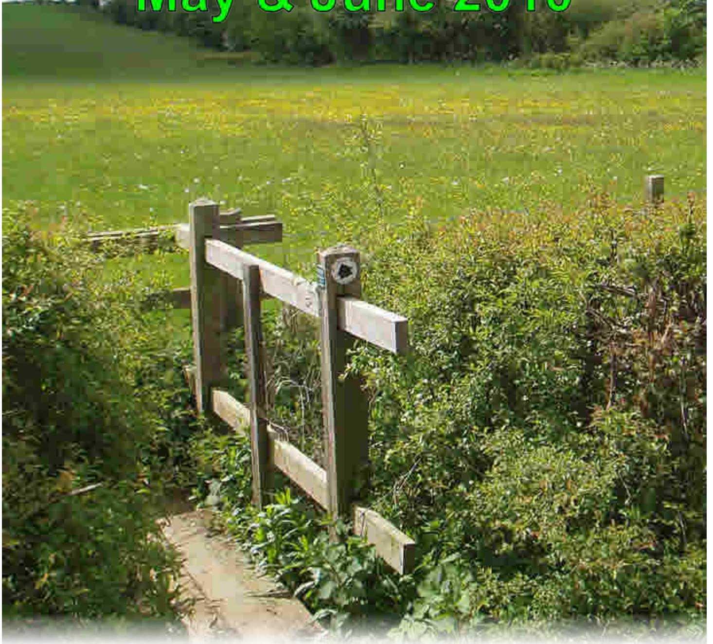
path from Pattishall to canal, May 2008